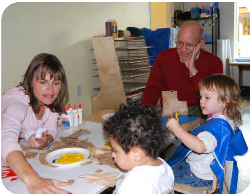
See more about the Relief Nursery on page 2

Congressman, Peter DeFazio will soon find himself the congressman for Corvallis as redistricting takes place in January, 2012. His sincere interest in the work of Old Mill and in our new Relief Nursery children was appreciated by our staff. Our "therapy" cat, Jack, was also a favorite.